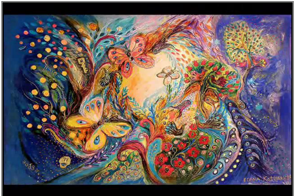
Figure 1: Please click on this image to download and view an audiovisual presentation of a number of Chagall paintings